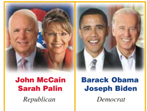
John McCain Sarah Palin Republican

Responses reflect the positions of the presidential candidates. Positions for all candidates are based on responses to a Cornerstone Policy Research questionnaire, recorded votes, media reports and/or public statements.”